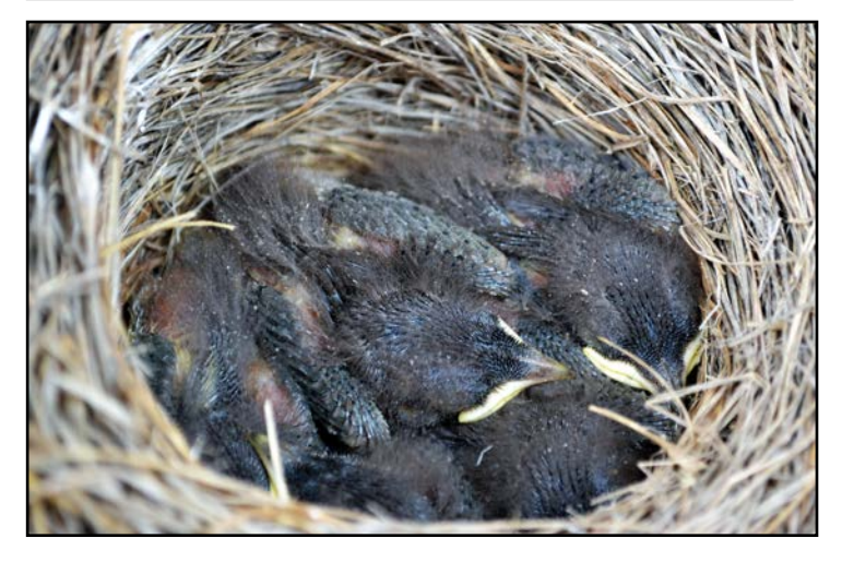
Top: Tree swallows fledge. Middle: Tree swallows observe. Bottom: Baby bluebirds. More pix next page.