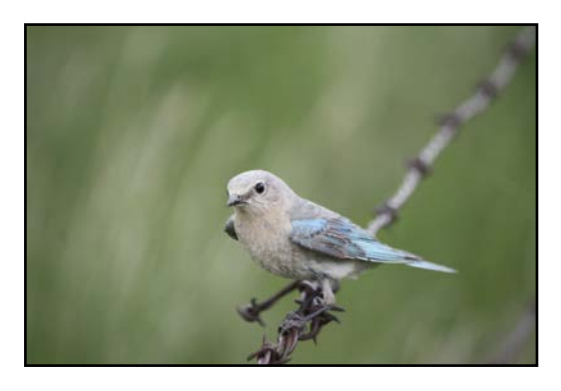
Top photo: Blue-Gray Tanager