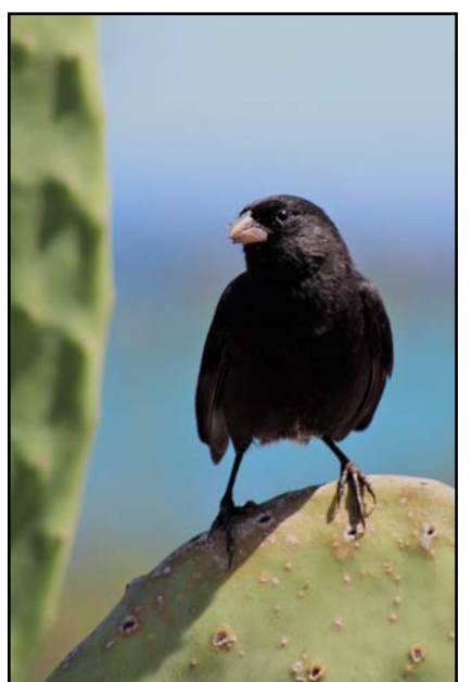
Darwin's Finches Clockwise, from top left: Large ground finch; common cactus finch, large cactus finch; medium ground finch; woodpecker finch; small ground finch; medium ground finch;